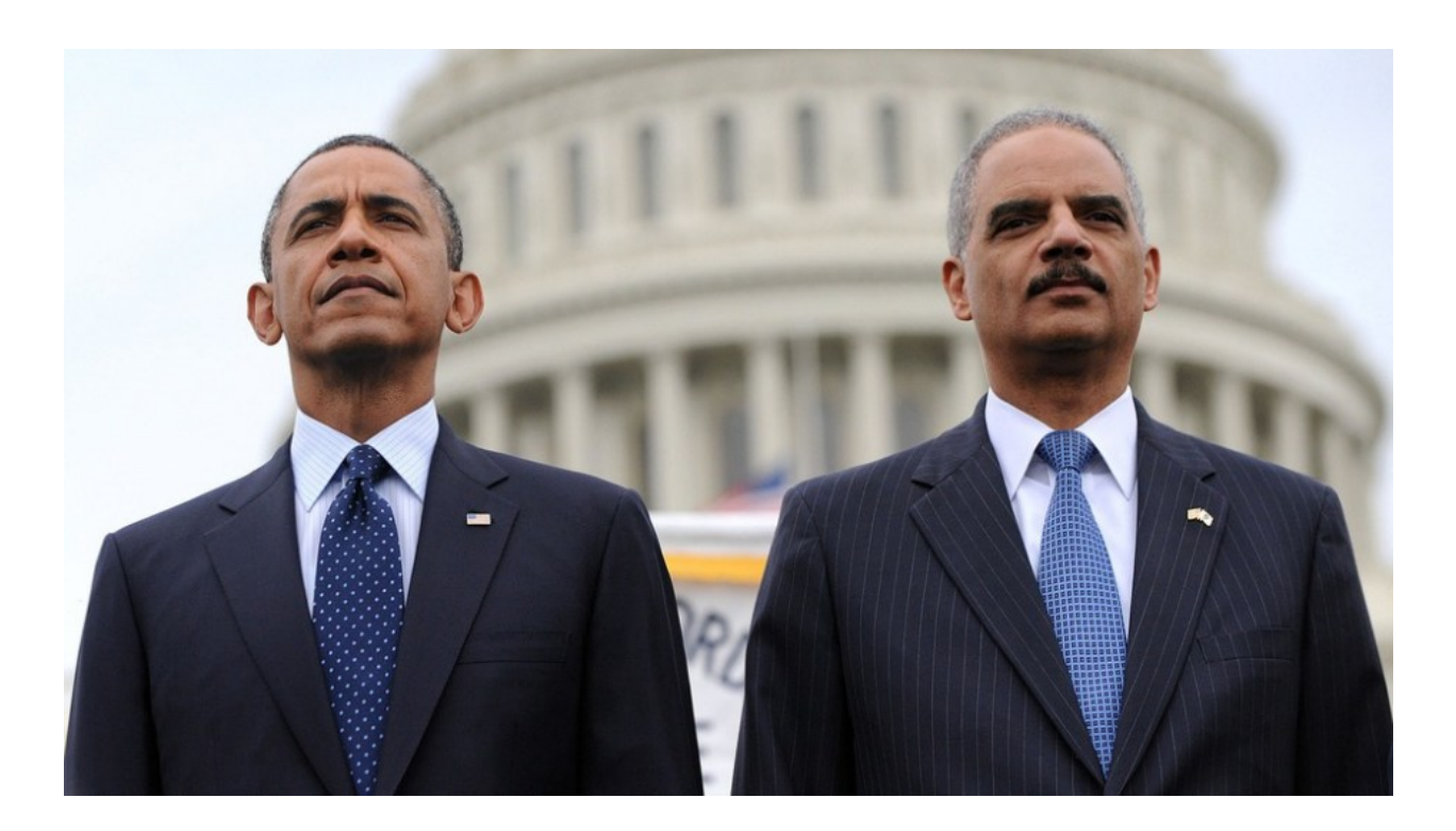
#10: Fast and Furious was all about gun confiscation

One of the earliest of Obama-era was "Operation Fast and Furious," a scandal of such monumental proportions it nearly cost Americans the right to keep and bear arms.