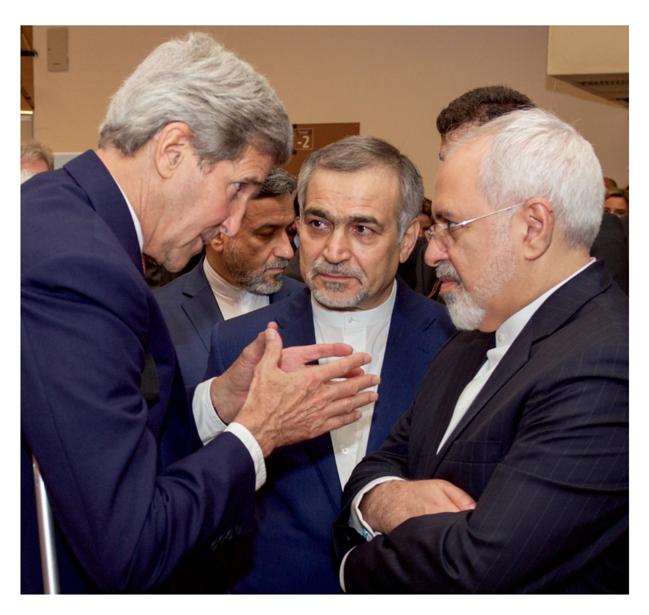
#7: Obama's treason: The Iran Nuclear Deal

Shortly after taking office Obama embarked on a mission to empower the Iranians – who have long been sworn enemies of America – with the ability to not only build nuclear weapons at some point in the future, but to make sure they were enriched along the way.