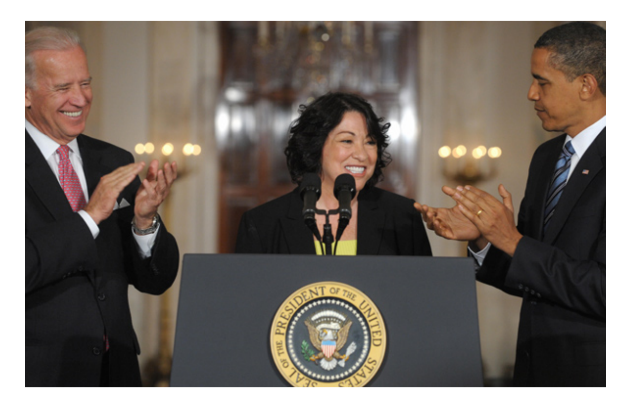
#9: Obama packed the federal courts with Constitution-hating Leftist judges

One the primary ways Obama sought to protect his Left-wing, liberty-destroying legacy was by "packing" the Federal Court for the D.C. Circuit with activist, like-minded judges.