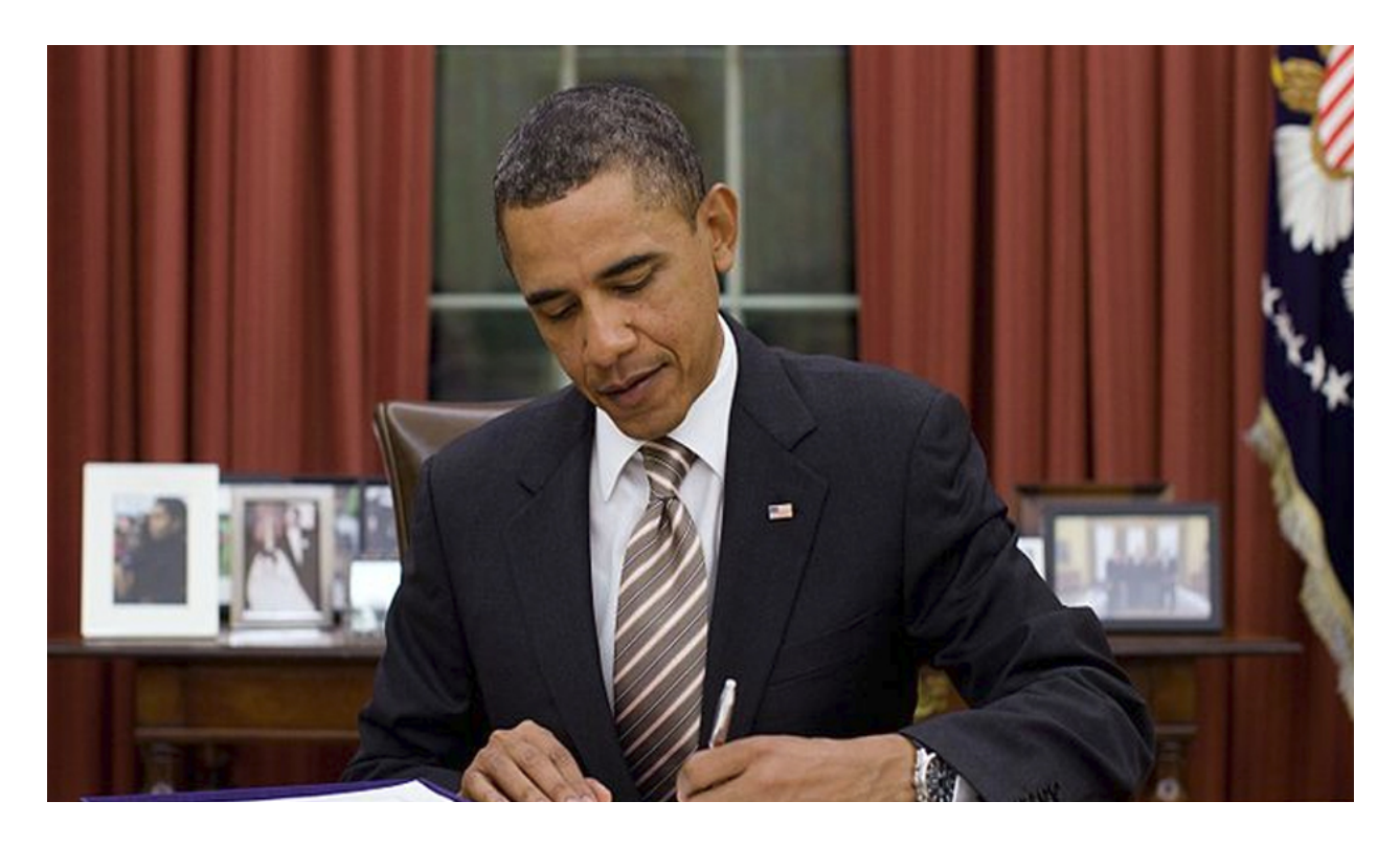
#4: Obama pushed through the Dark Act-blocking GMO labeling nationwide, even though 90% of Americans want GMOs labeled

Absolutely revoking mandates already in place for labeling GMOs (genetically modified organisms) in states such as in Vermont, the "Safe and Accurate Food Labeling Act of 2015" was everything but safe and accurate, and Obama knew it.